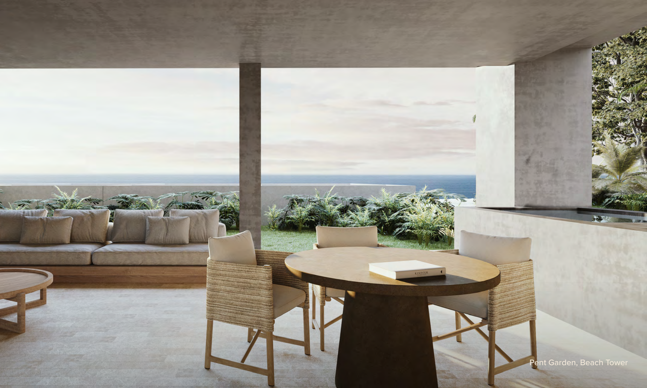
Pent Garden, Beach Tower