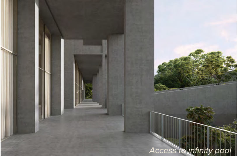
Access to infinity pool