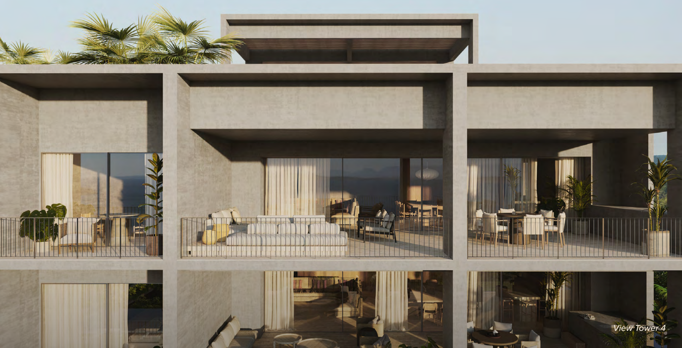
View Tower 4